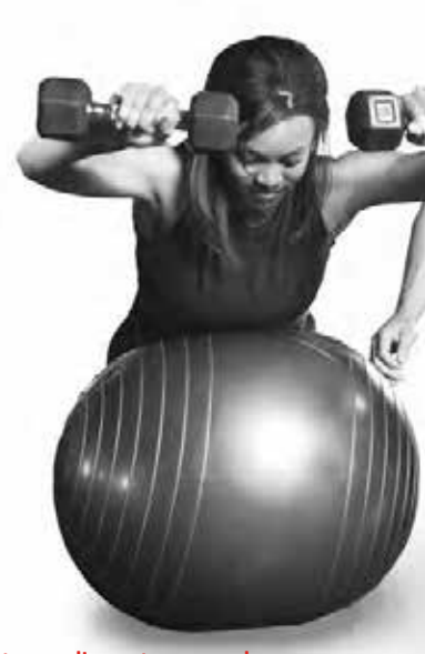
Register online at ymcamke.org