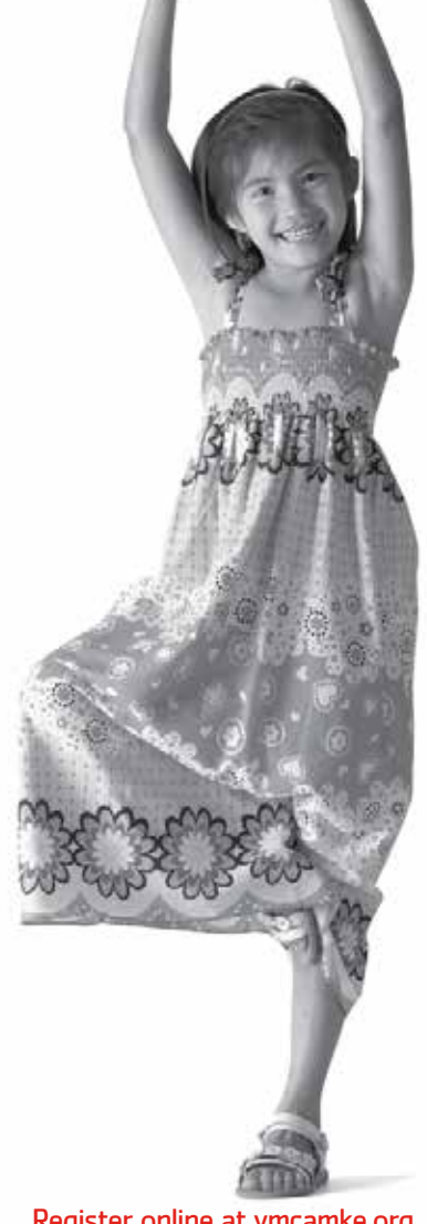
Register online at ymcamke.org